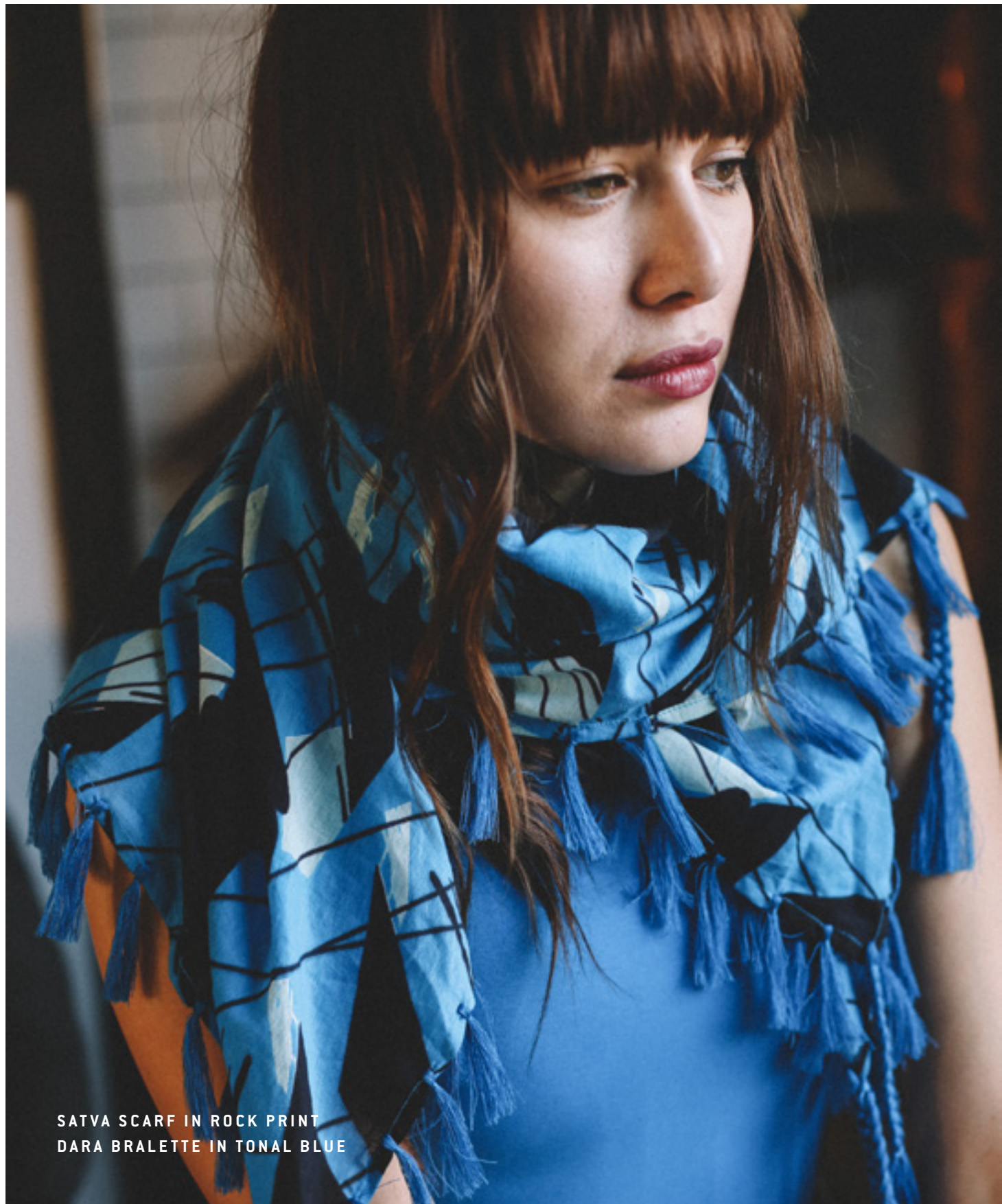
SATVA SCARF IN ROCK PRINT DARA BRALETTE IN TONAL BLUE