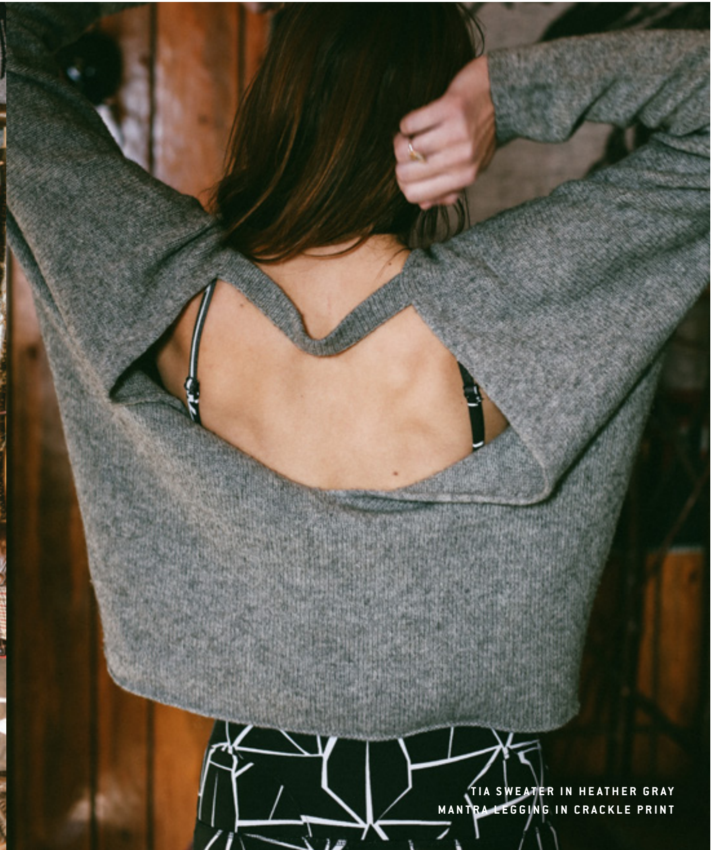
TIA SWEATER IN HEATHER GRAY MANTRA LEGGING IN CRACKLE PRINT