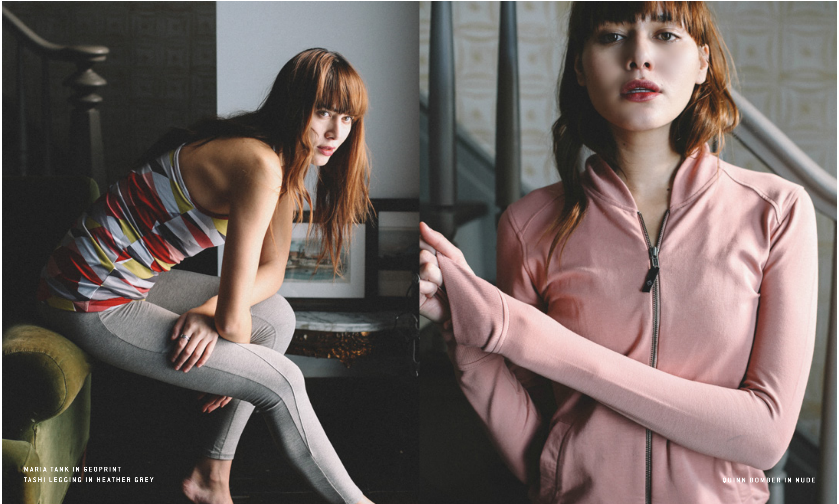
MARIA TANK IN GEOPRINT TASHI LEGGING IN HEATHER GREY