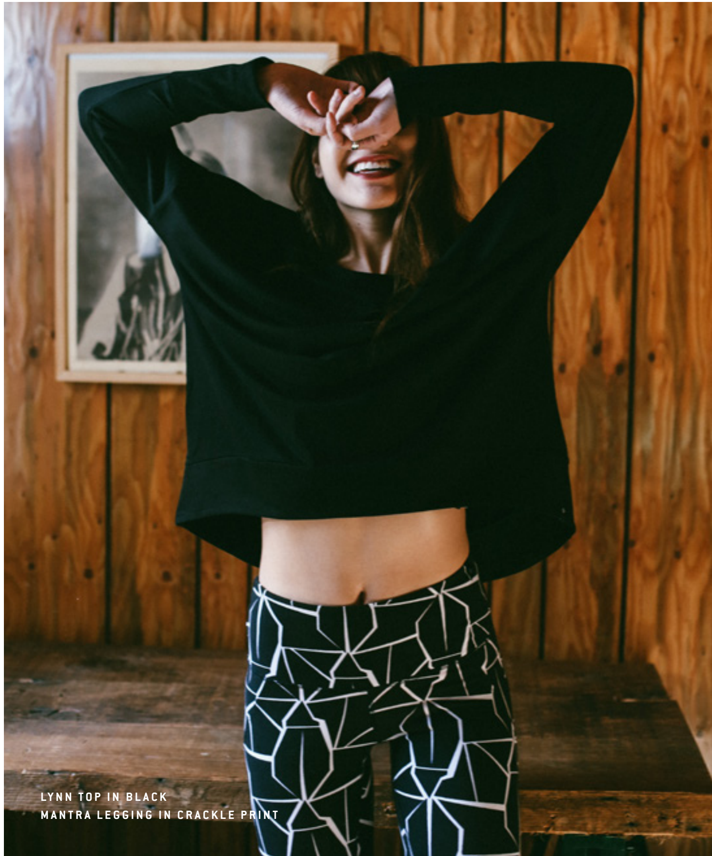
LYNN TOP IN BLACK MANTRA LEGGING IN CRACKLE PRINT