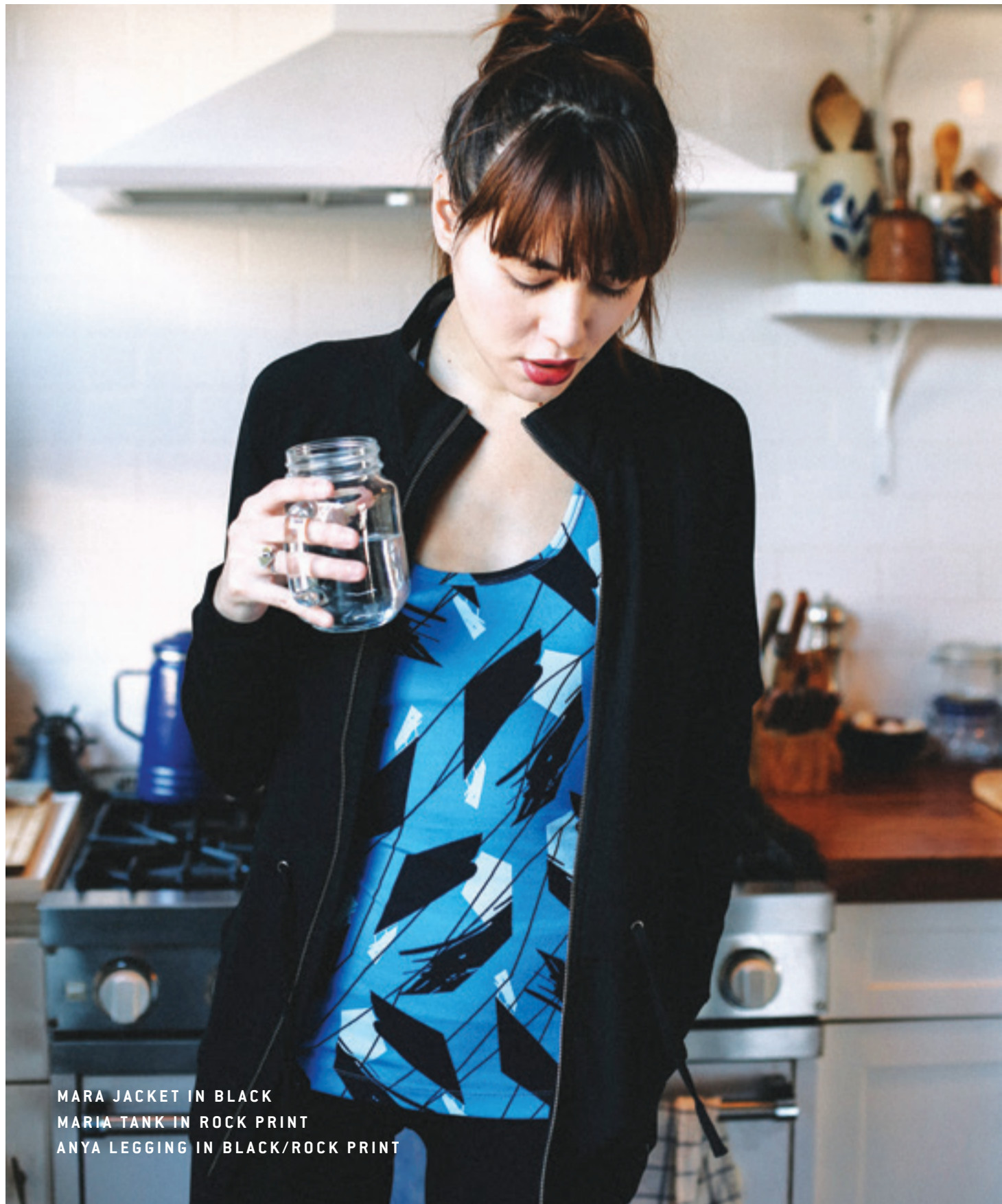
MARA JACKET IN BLACK MARIA TANK IN ROCK PRINT ANYA LEGGING IN BLACK/ROCK PRINT