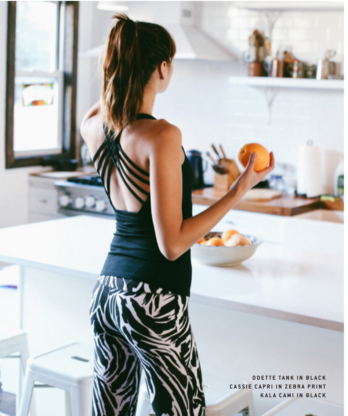
ODETTE TANK IN BLACK CASSIE CAPRI IN ZEBRA PRINT KALA CAMI IN BLACK