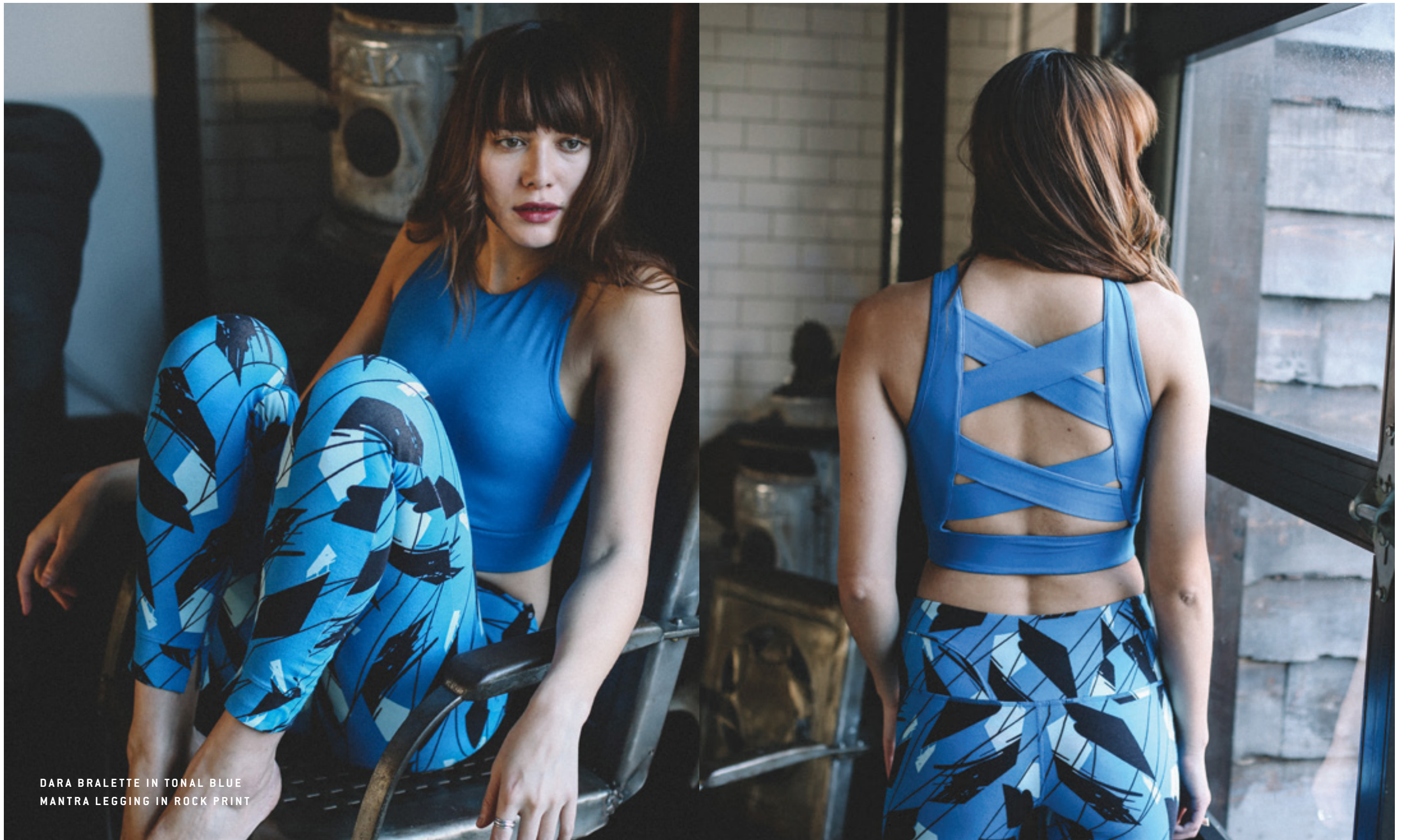
DARA BRALETTE IN TONAL BLUE MANTRA LEGGING IN ROCK PRINT