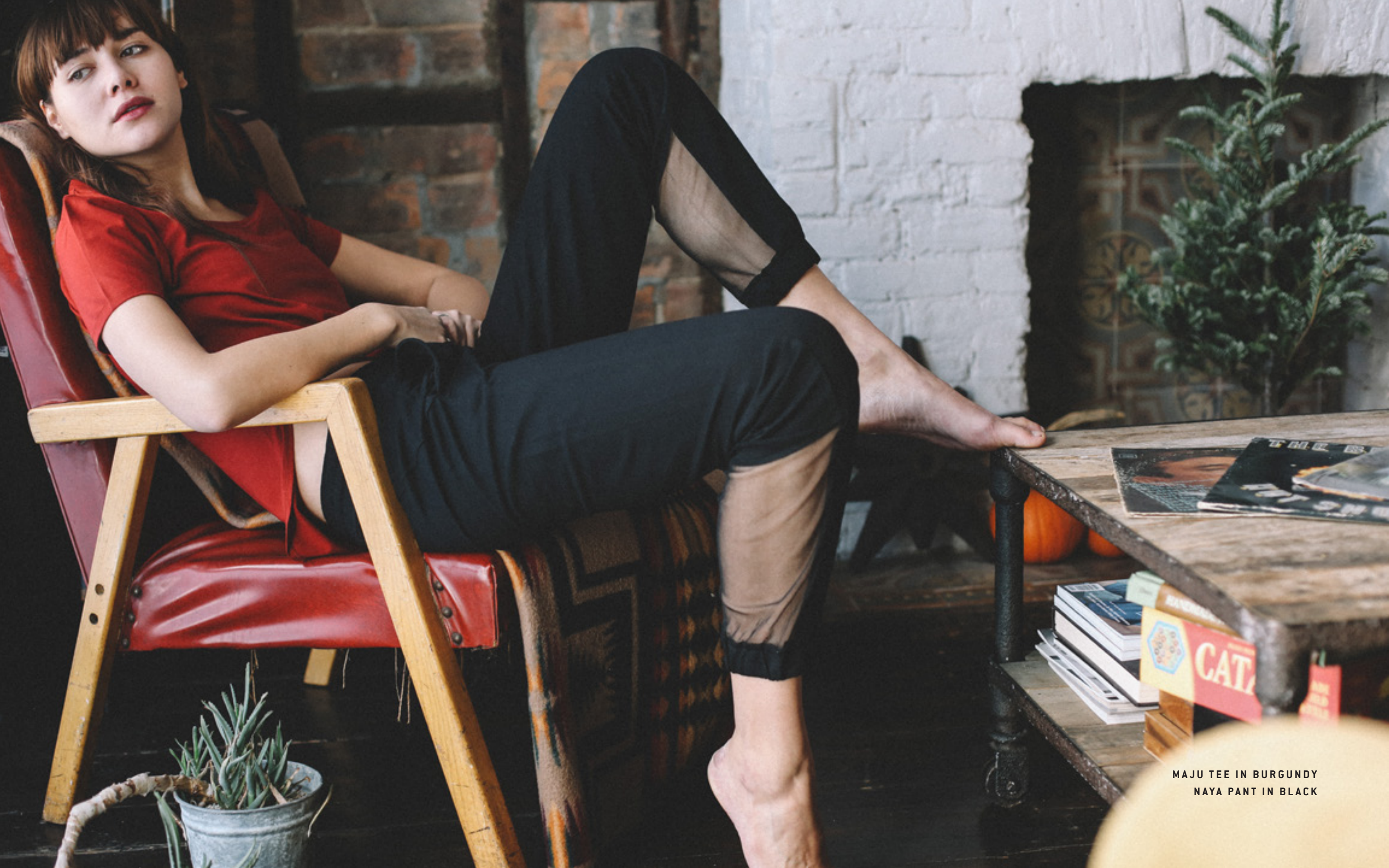
MAJU TEE IN BURGUNDY NAYA PANT IN BLACK