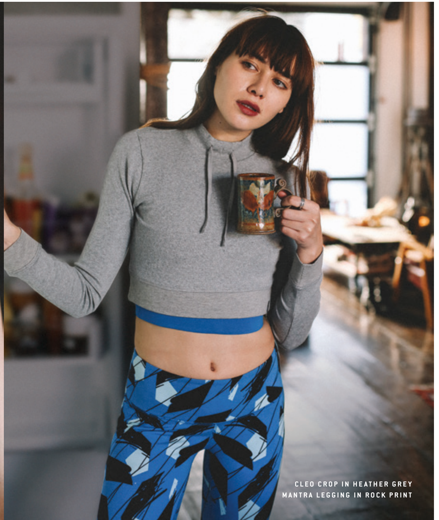
CLEO CROP IN HEATHER GREY MANTRA LEGGING IN ROCK PRINT