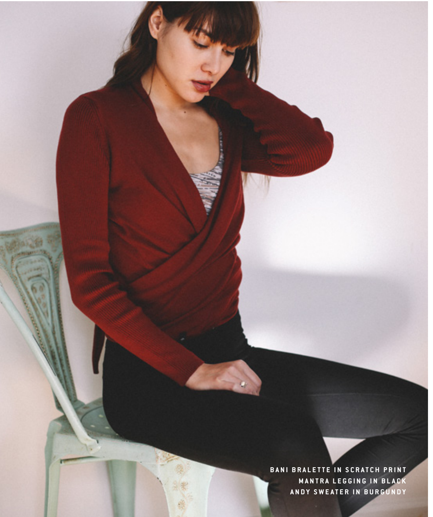
BANI BRALETTE IN SCRATCH PRINT MANTRA LEGGING IN BLACK ANDY SWEATER IN BURGUNDY