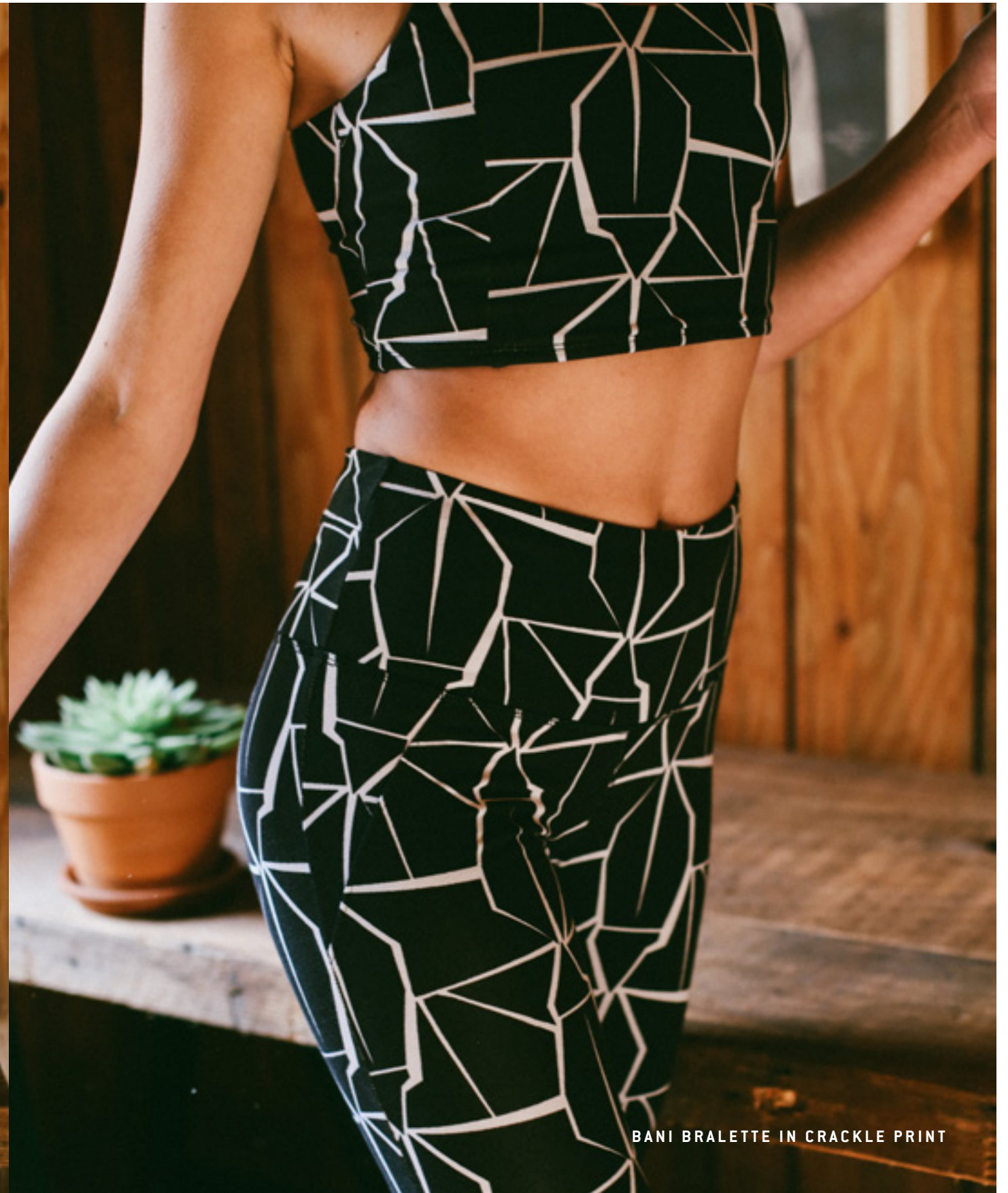
BANI BRALETTE IN CRACKLE PRINT